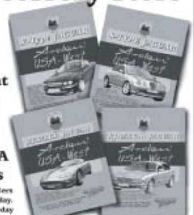
Full color Arden® brochures for XK8, XJ8, S-TYPE AND X-TYPE

* XKs' normal policy is to fill and ship orders received before 2:00 pm, Pacific time, the same-day. Unforeseen circumstances may cause delays, next-day shipping may result in some cases.