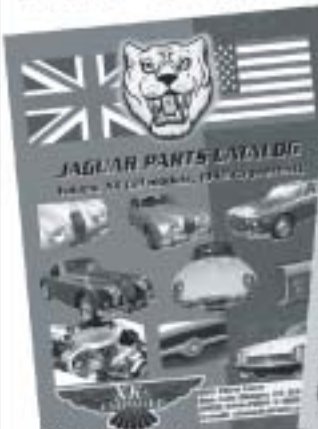
384 page Vol. XII, Jaguar Parts Catalog