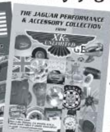
80 page Vol. I, Jaguar Performance & Accessory Collection