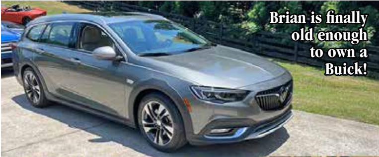
Brian is finally old enough to own a Buick!