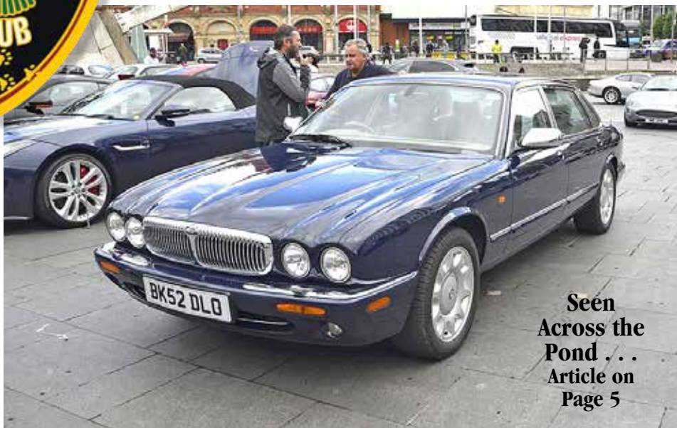
Seen Across the Pond . . . Article on Page 5

August 17 - Judge's Training, 10:00 AM, GA Expo, Suwanee, GA